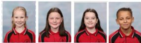
Junior School Council Semester 2 Members

We are a Respectful Relationships School