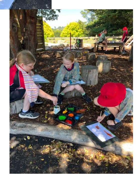
"The aim of art is to represent not the outward appearance of things, but their inward significance." - Aristotle