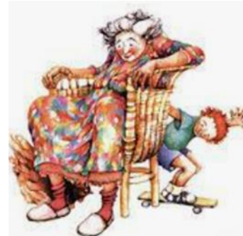
Wilfrid Gordon McDonald Partridge

Red and Green Homegroup students had a fabulous excursion to Warragul on Wednesday last week. Students met in Civic Park and took a stroll to the Warragul library. We had a library tour, Storytime and played with the library's excellent Lego collection. We then walked back to the park for some lunch before heading to the West Gippsland Arts Centre to view the Australian Chamber Orchestra's production of Wilfrid Gordon McDonald Partridge. We were entertained by the characters as they told the popular Mem Fox story, accompanied by two violins, a viola and a cello. We also had the opportunity to ask questions of the musicians at the conclusion of the performance. We ended our day with another play in the park. A great day was had by all and as you can see from the feedback included below, students were REAL kids whilst out in the community.